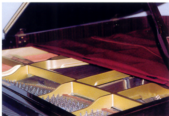
Underside of cover