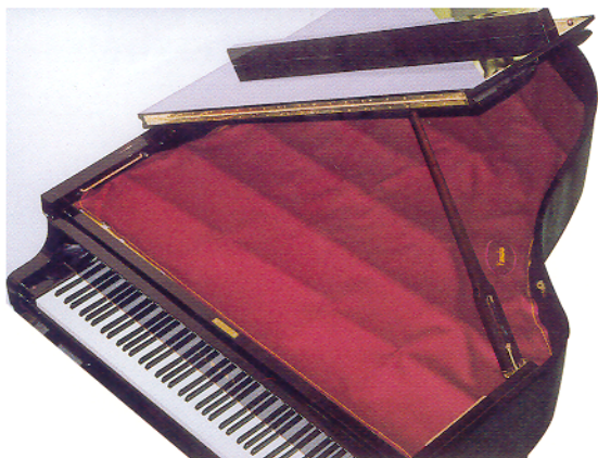
Cover in place